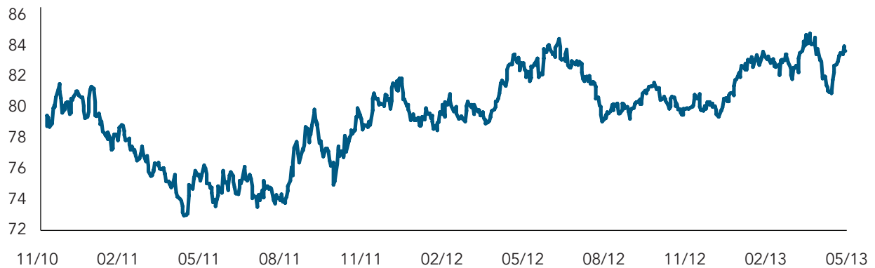
Exhibit 1 US DOLLAR INDEX

Yet, US inflation is now broadly where it was, and the US dollar is higher than when those warnings were issued (see charts below), suggesting that basing an investment strategy around supposedly expert forecasts is not always a good idea.